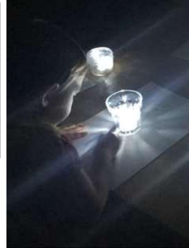
Sinclair, Josie, Anyia, + Wren, April 19th 2018 Light + Shadow: Drawing in the Dark with tea lights in glass jars