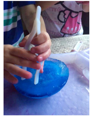
Lola & Colin investigate the mechanics & functions of tongs.