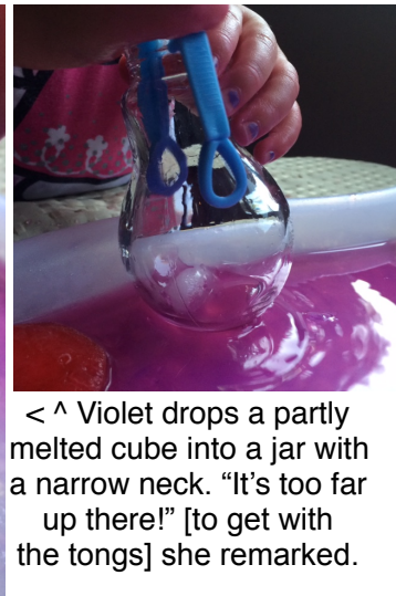
< ^ Violet drops a partly melted cube into a jar with a narrow neck. "It's too far up there!" [to get with the tongs] she remarked.