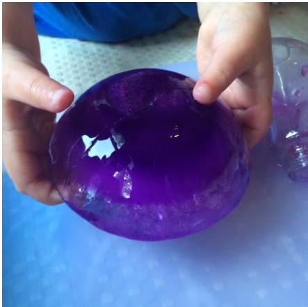
"It's so cold! – Wren