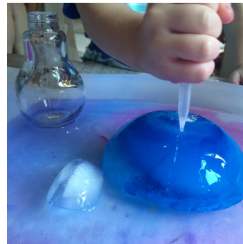
^ Colin tries to draw liquid into the dropper from ice. > Kahlan drops liquid directly through the shaker's holes.