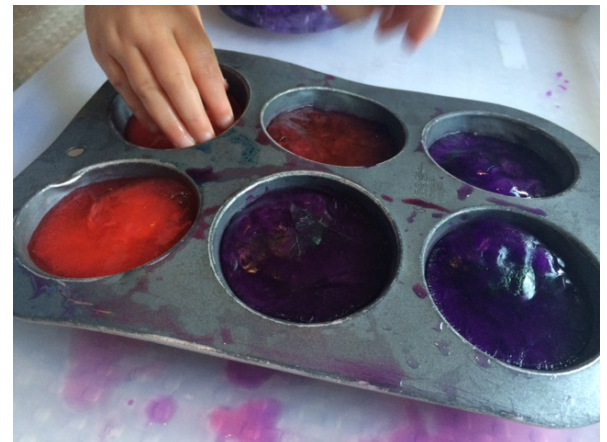
Eden, Colin, & Lila work to access the ice still stuck in the tray.