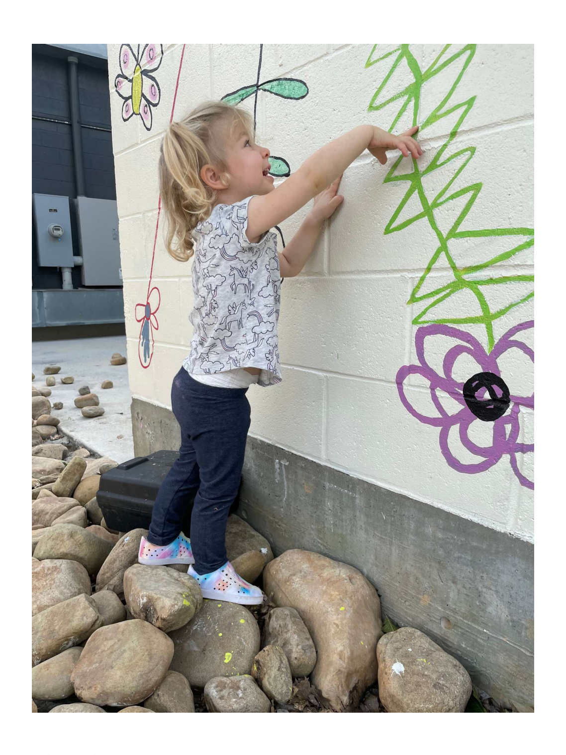
Abby - "Pink! Peach!"