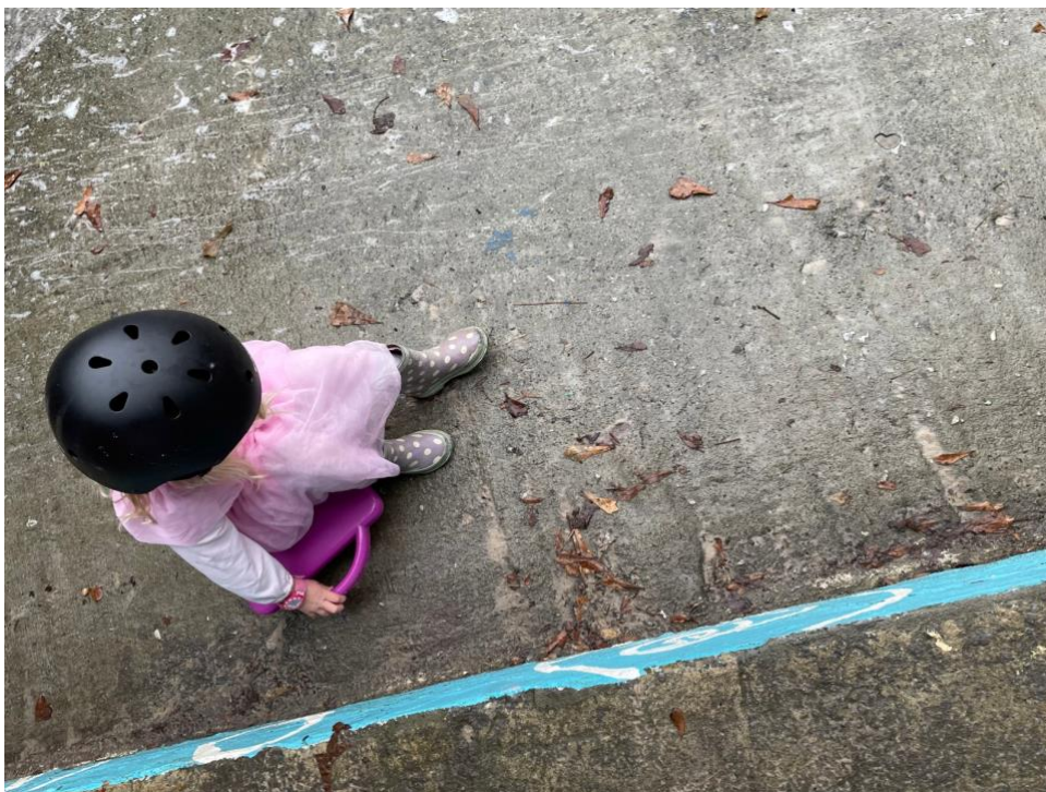
Away she goes....