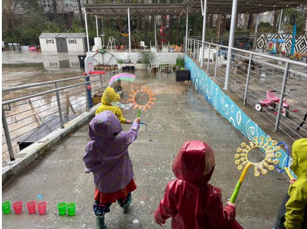
“Try to catch my bubble!” - Porter