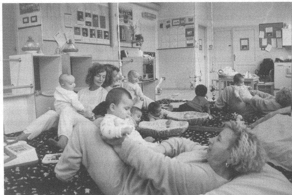
FIGURE 9.1. Teachers hold and play with infants in a way that imitates the style of parents. (Infant-toddler Center Sagittario, Modena)

ity to gradually hildren, and the proach to infant ed space that in- ortunities to ob-