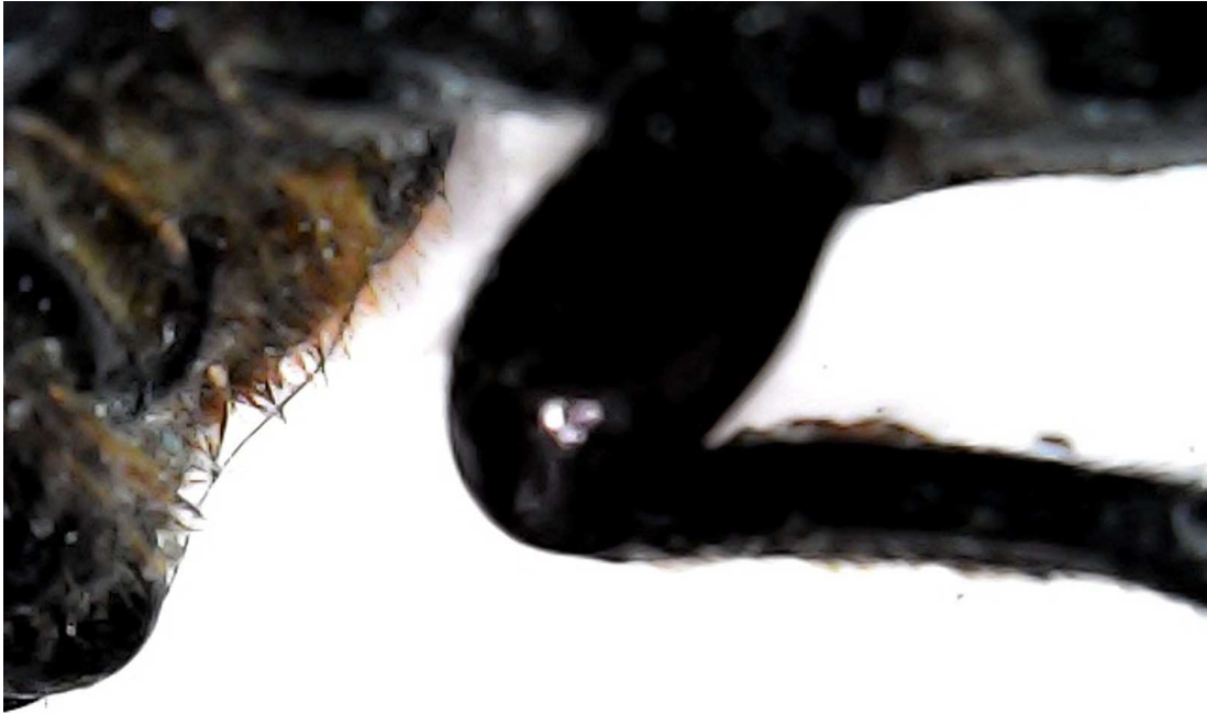
The leg of a beetle.