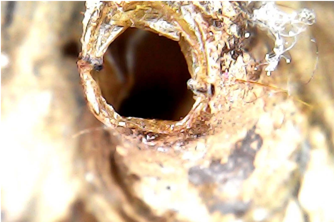
A hole inside of the body of a Cicada.