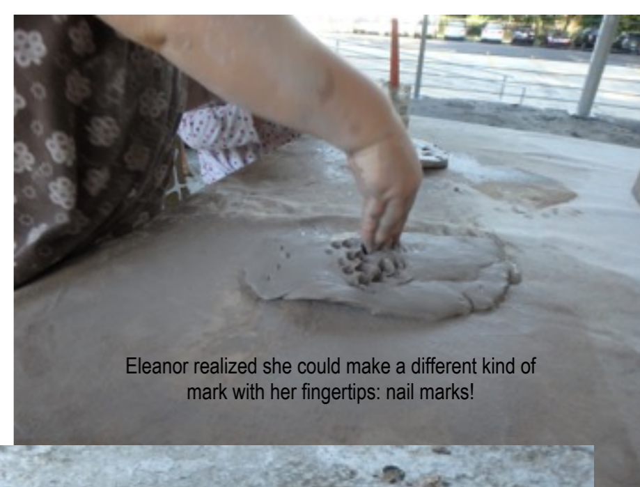
Eleanor realized she could make a different kind of mark with her fingertips: nail marks!