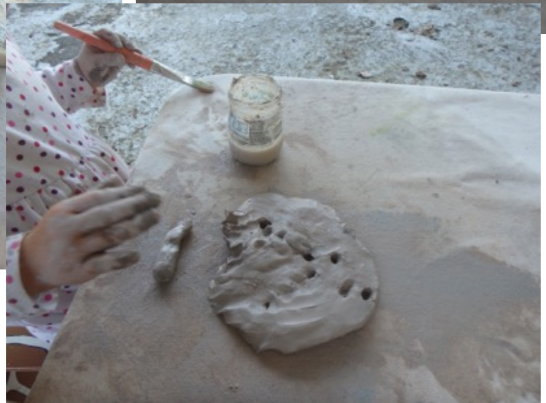
"I'm squishing the snake down!"