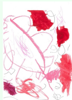
Emily's bold geraniums.