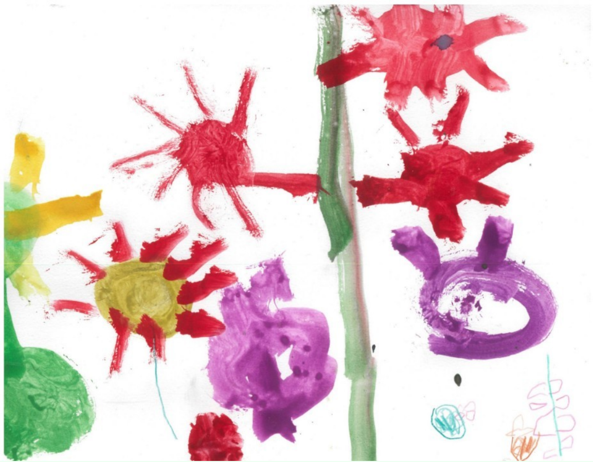
Cassie's first painting of a filled, blooming garden complete with the bee (purple, bottom right corner) Nasir observed. The yellow center of one of her flowers is "the pollen."