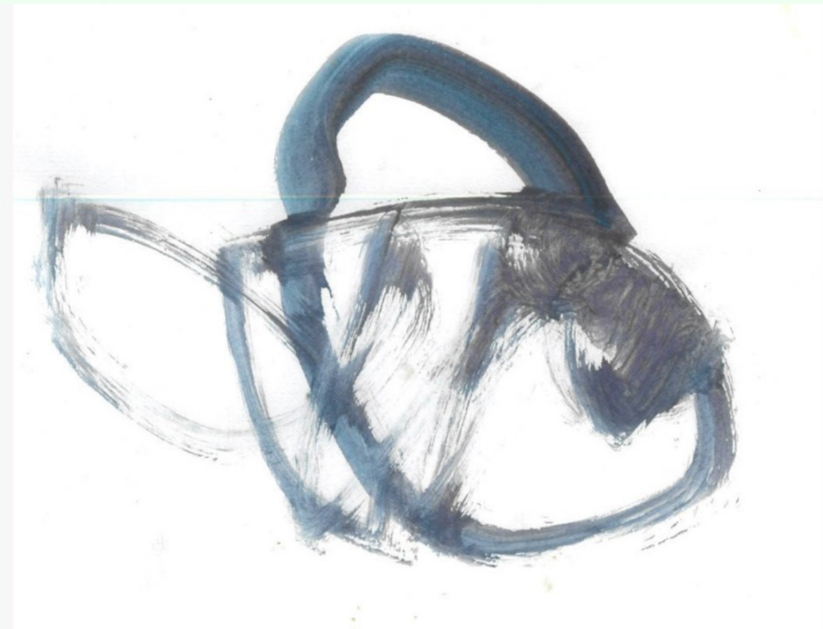
Nasir's bee, as he observed in the garden.