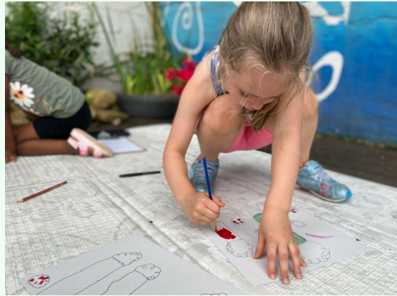
Nora's imaginative macro perspective with flowers, bushes, & whimsical trees.