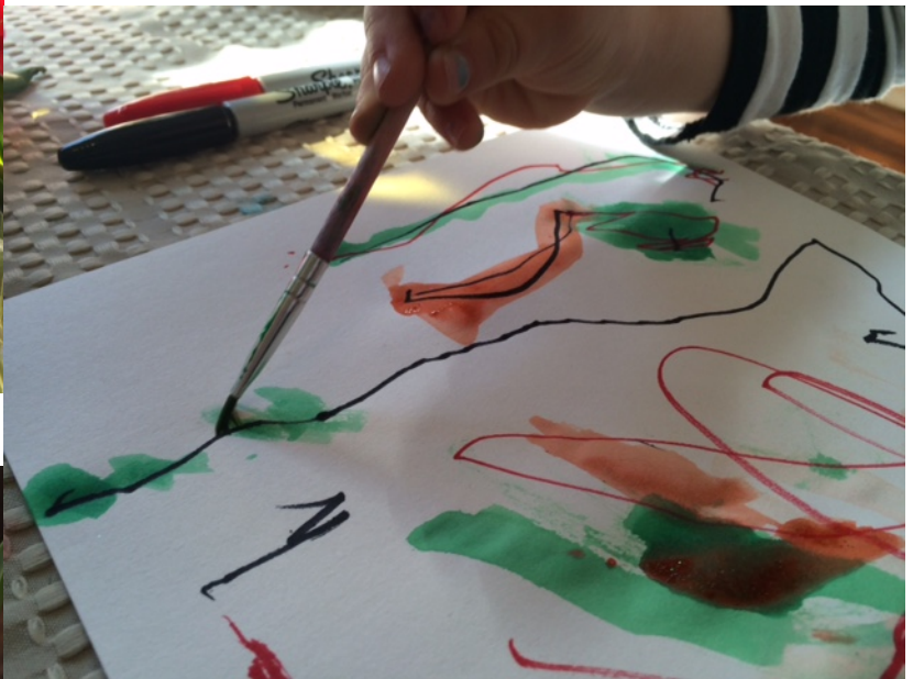
Cyla consistently draws a line or shape with a permanent marker then "traces" it with watercolor.