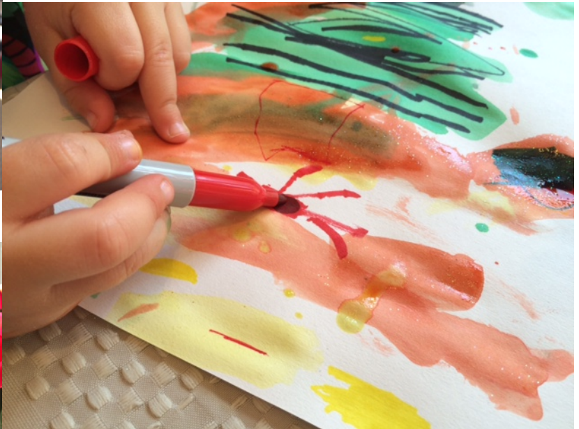
After drawing "stems" (see the green painted lines in the background), Helena creates a sun for her flowers.