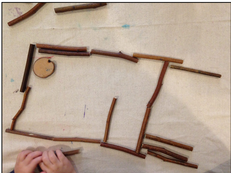
Elena carefully constructs a picture of "a garage". She describes to me that the driveway is on the right. The car comes in and parks in the small space, and the larger space is for a truck. The wood round is a stool.