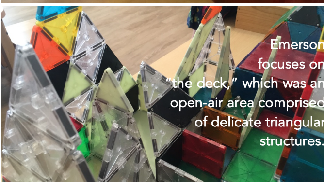
Emerson focuses on "the deck," which was an open-air area comprised of delicate triangular structures.